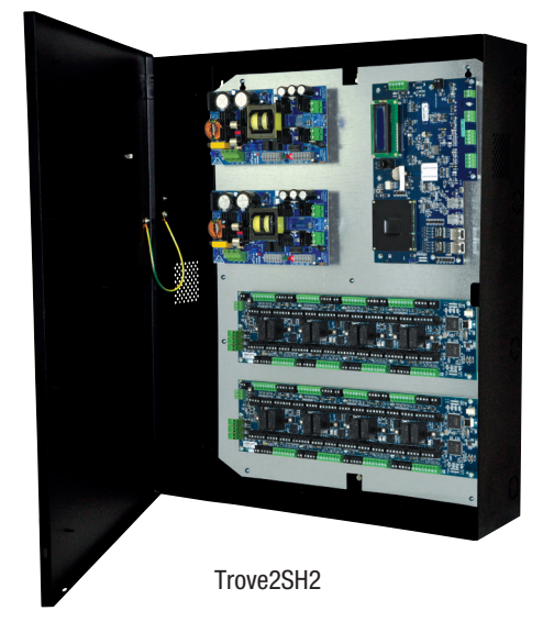
* Boards not included