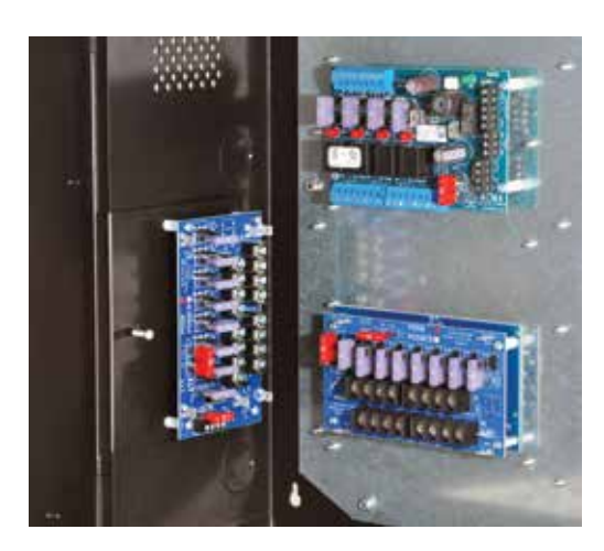
BR1 with Sub-Assembly (not included), mounted inside a Trove enclosure